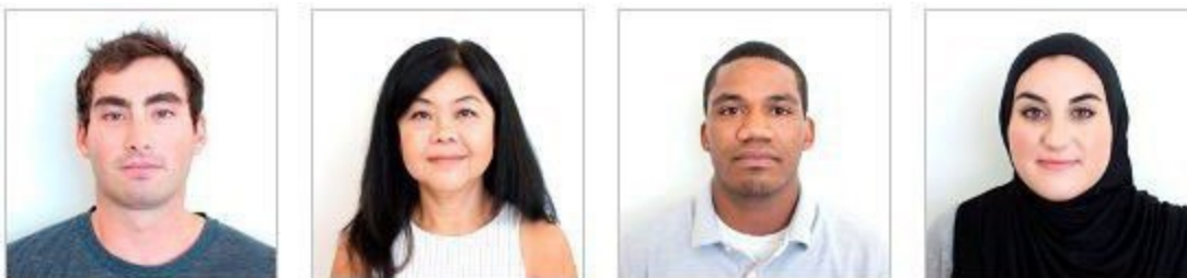
Photo IDs will be mailed to the address on file in the advising office.